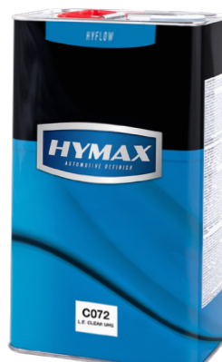
C072 UHS Low VOC C075 UHS Express C076 Air - Dry VOC