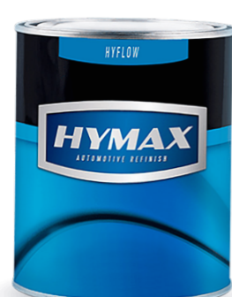
HYFLOW Single Stage