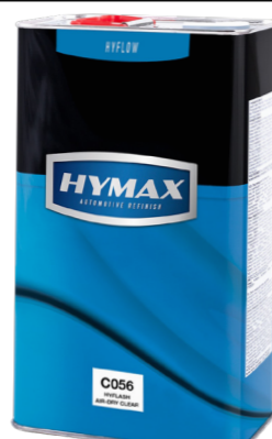
C023 Easy Clear C056 Air - Dry Clear