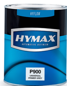
P900 Universal Primer Grey