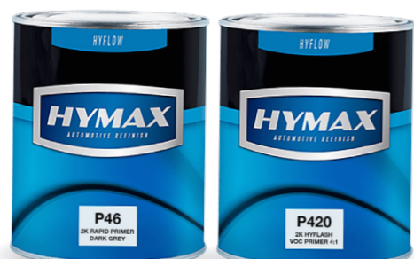
P42/44/46 Rapid Primer P420/24/26 Hyflash 2K VOC