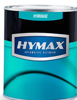
HYDROBASE W Basecoat